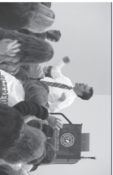
A capacity crowd of 400 filled the Crozier-Williams Center